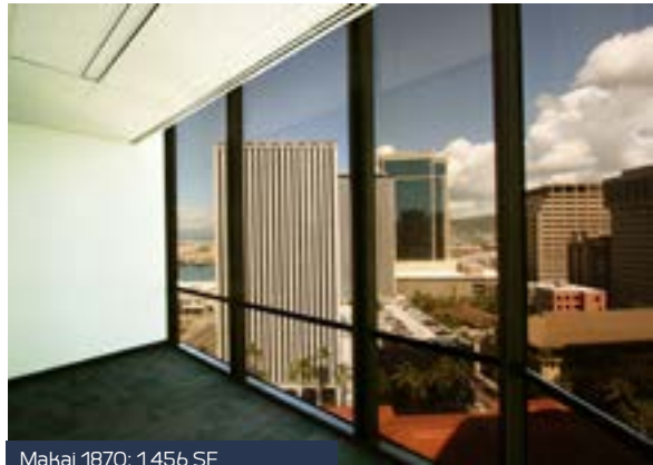
Makai 1870: 1,456 SF