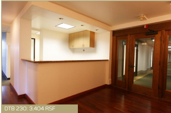
DTB 230: 3,404 RSF