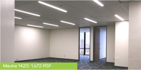
Mauka 1420: 1,672 RSF