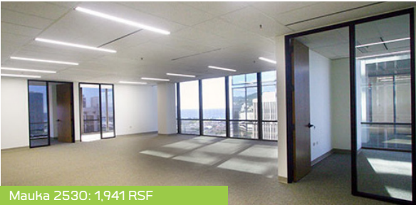
Mauka 2530: 1,941 RSF