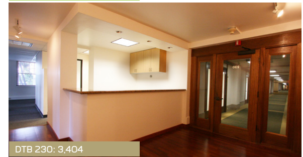
DTB 230: 3,404