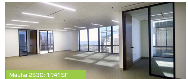
Mauka 2530: 1,941 SF