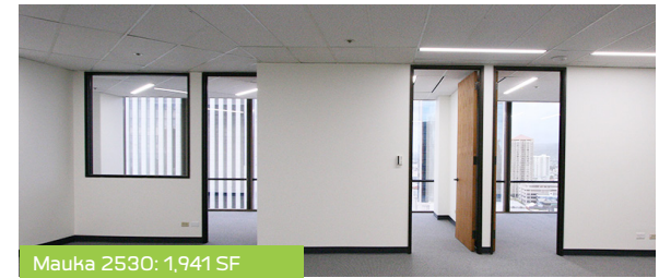
Mauka 2530: 1,941 SF