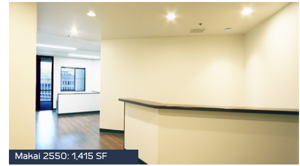
Makai 2550: 1,415 SF