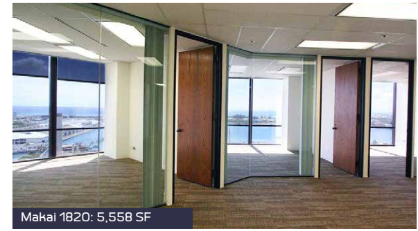
Makai 1820: 5,558 SF