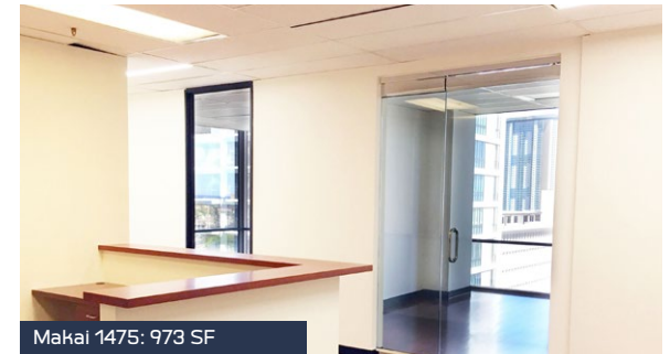
Makai 1475: 973 SF