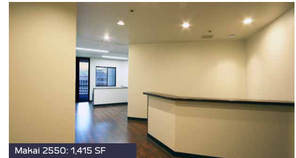
Makai 2550: 1,415 SF