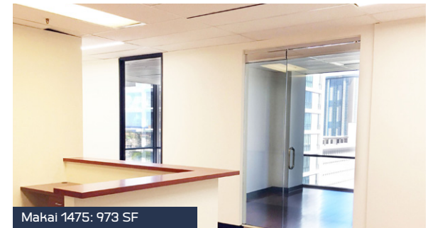
Makai 1475: 973 SF